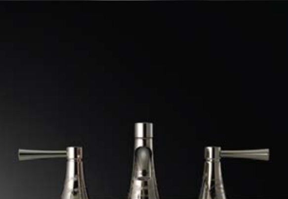
TL794DD#PN-K1 Faucet - Polished Nickel