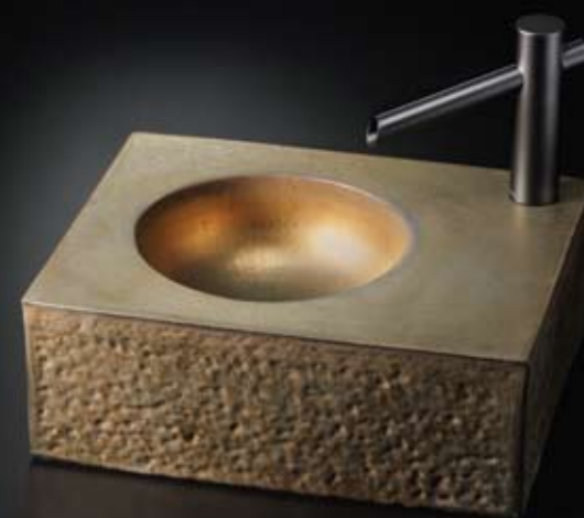
LT163#72 - Burnished Gold™ (Recommended faucet: TEL5GMY-60) 17-3/4"W x 14-1/8"D x 6-1/4"H

Waza Aya's Burnished Gold is a perfect representation of the richness and luxury of aged gold. Its subdued luster only adds to the impression of opulence and antiquity.