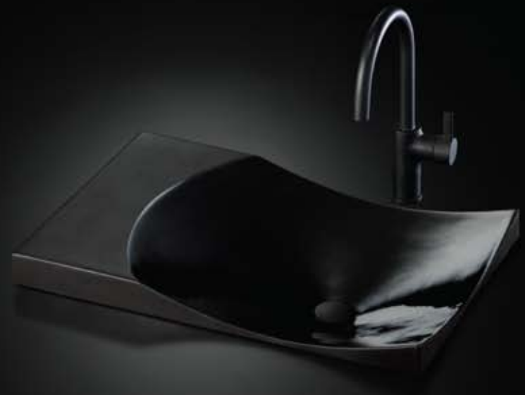
FLT132 - Waza™ Noir™ Self-Rimming Lavatory (Recommended Faucet: TL382SDL#TB) 24"W x 14-15/16"D x 2-1/8"H

The self-rimming Waza Noir lavatory charts the contrast of two very different shapes: a circle and a rectangle. Like in the natural world, contrast often creates beauty, which is illustrated in the varying shapes and the transition from glossy to matte finish. Though difficult to achieve, the distinctive lavatory’s organic form appears effortless and natural.