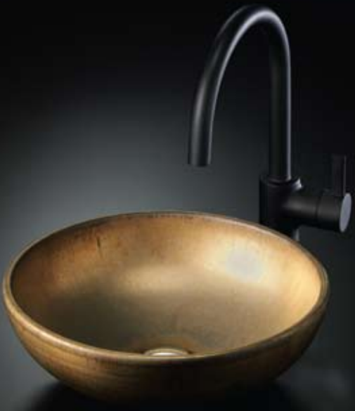
LT162#72 - Burnished Gold™ (Recommended faucet: TL382SDL#TB) 5-1/2"H x 15-3/4"DIA.

Waza Aya's Burnished Gold is a perfect representation of the richness and luxury of aged gold. Its subdued luster only adds to the impression of opulence and antiquity.