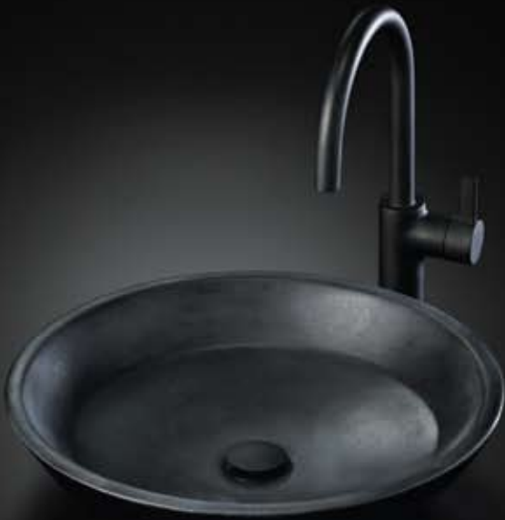
FLT141 - Waza™ Noir™ Vessel Lavatory (Recommended Faucet: TL382SDL#TB) 18-1/8"DIA. x 2-1/8"H

*Can be mounted as vessel, undercounter or self-rimming lavatory