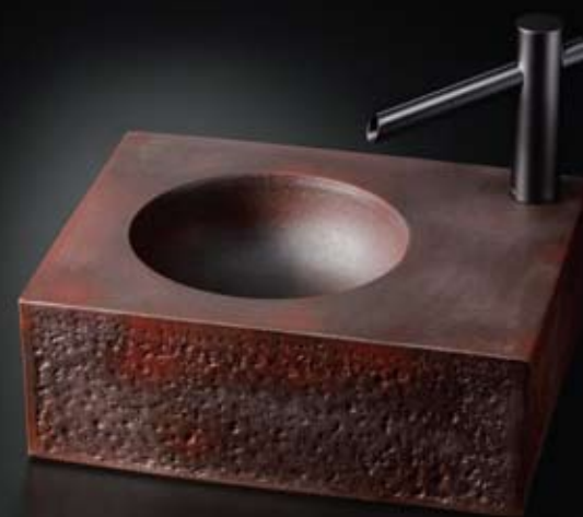
LT163#75 - Autumnal Red™ (Recommended Faucet: TEL5GMY-60) 17-3/4"W x 14-1/8"D x 6-1/4"H

Autumnal Red brings the Waza Aya lavatories to dazzling life, just like the deep-red maple leaves of autumn in Japan that inspired the color.