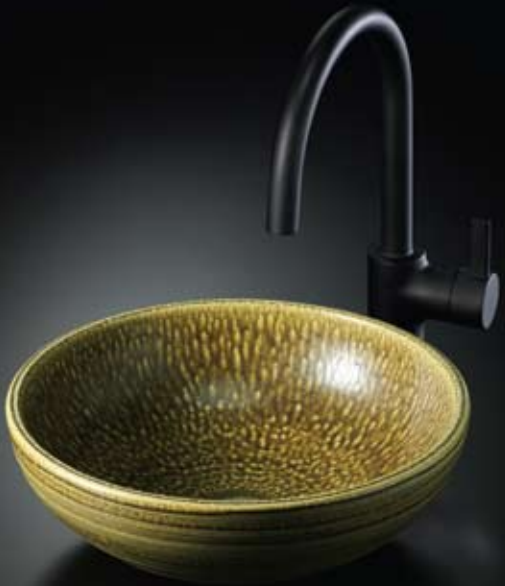
LT162 #74 - Woodland Green™ (Recommended faucet: TL382SDL#TB) 5-1/2"H x 15-3/4"DIA.

Woodland Green can be spied on the wings of Japanese robins, in the tint of green tea and now in Waza Aya lavatories, forming a perfect intersection of nature and artistry.