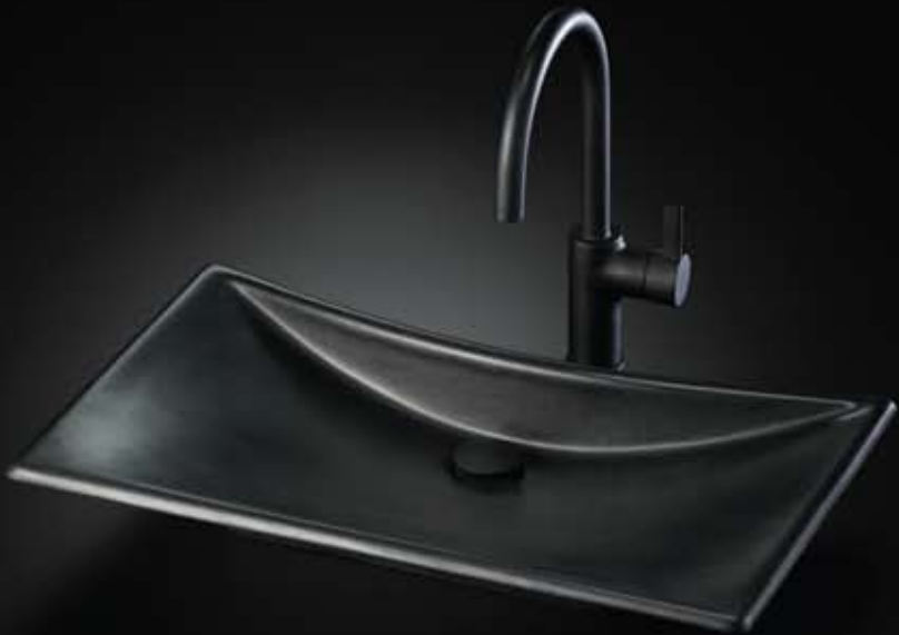
FLT142 - Waza™ Noir™ Rectangle Lavatory (Recommended Faucet: TL382SDL#TB) 25-9/16"W x 17-1/16"D x 7"H

A form within a form, like the ripples remaining after a water drop breaks the surface of a pool. The Waza Noir vessel lavatory transforms a simple concept and shape into a work of art, made even more striking by the Matte Black finish. Yet, the simplicity of the shape is also what makes it organic, a key principle of the Zen philosophy.