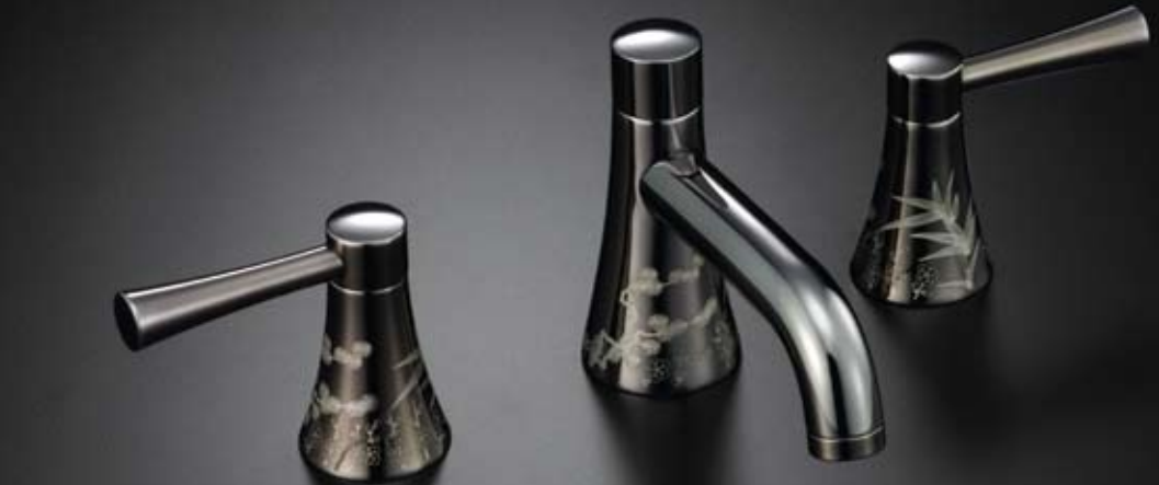
TL794DD#BL-K1 Faucet - Black Nickel

The faucets of the Waza Miyabi collection are also adorned with paintings of pine, bamboo and plum—or the “sho,” 松 “chiku,” 竹 and “bai” 梅 trees that symbolize happiness. Available in four finishes, these products provide a perfect complement to the beautiful, highly artistic collection.