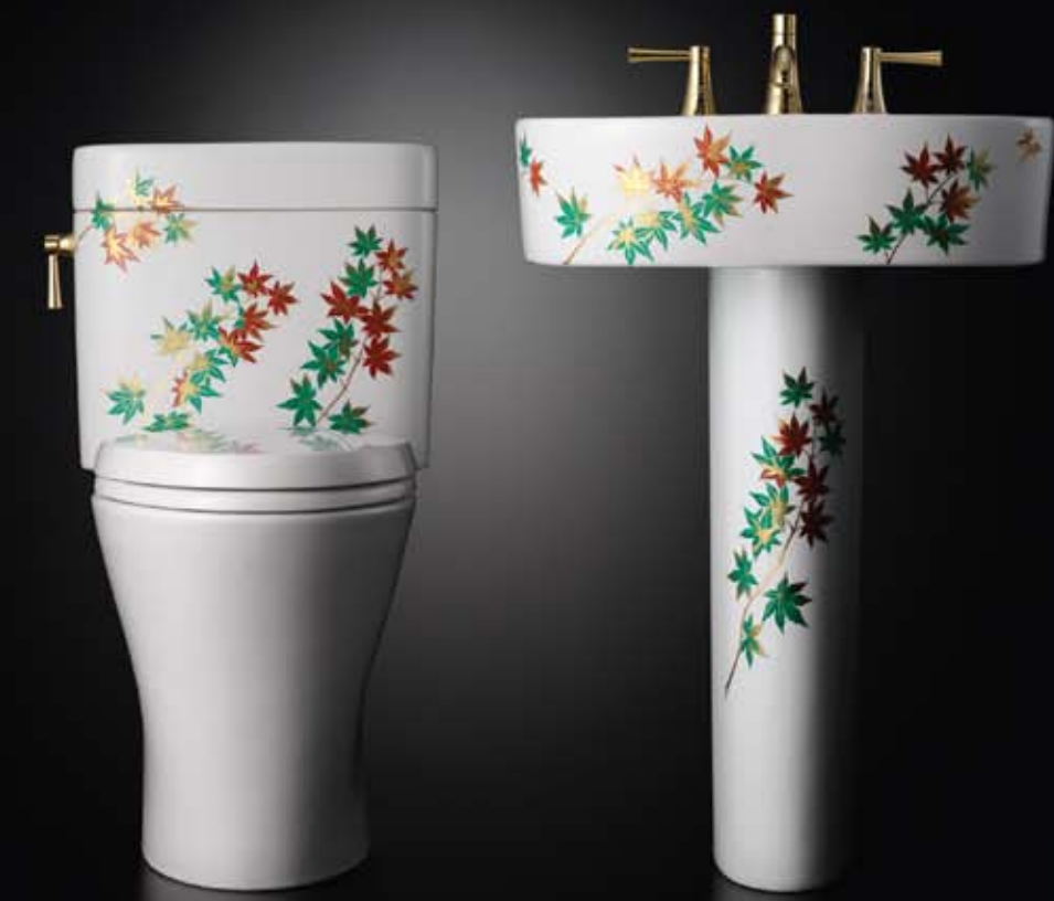
CST794EF#01-ML Toilet (Trip lever finish: Polished Brass) 32"H x 17-7/8"W x 28"D LPT790.8#01-ML Pedestal Lavatory - 24"L x 17-3/8"D x 34"H TL794DD#PB-K1 Faucet - Polished Brass

An eruption of autumnal color distinguishes the Maple Leaf design in the Waza Miyabi collection. As if captured in time, the delicate Japanese maple leaves transition from green to a deep red, especially in the mountain regions, just as they do around the world when the seasons turn cooler.