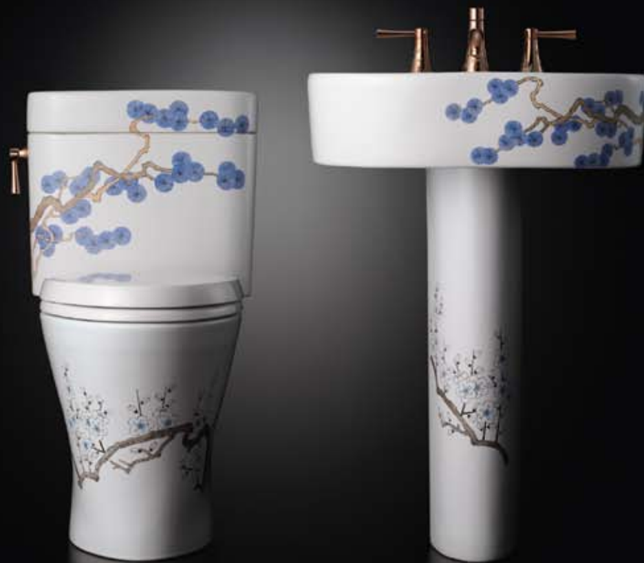
CST794EF#01-PP Toilet (Trip lever finish: Rose Bronze) 32"H x 17-7/8"W x 28"D

The Pine Tree design in the Waza Miyabi collection depicts both pine trees, on the upper portion of the product, and plum trees, on the bottom portion. In nature, these are two of the heartiest species, surviving even in the coldest season.