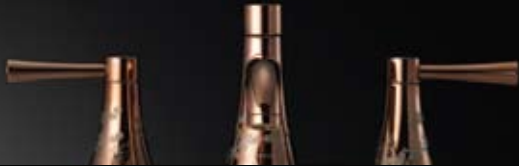
TL794DD#RS-K1 Faucet - Rose Bronze