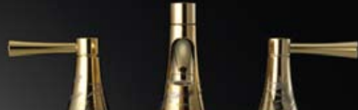
TL794DD#PB-K1 Faucet - Polished Brass