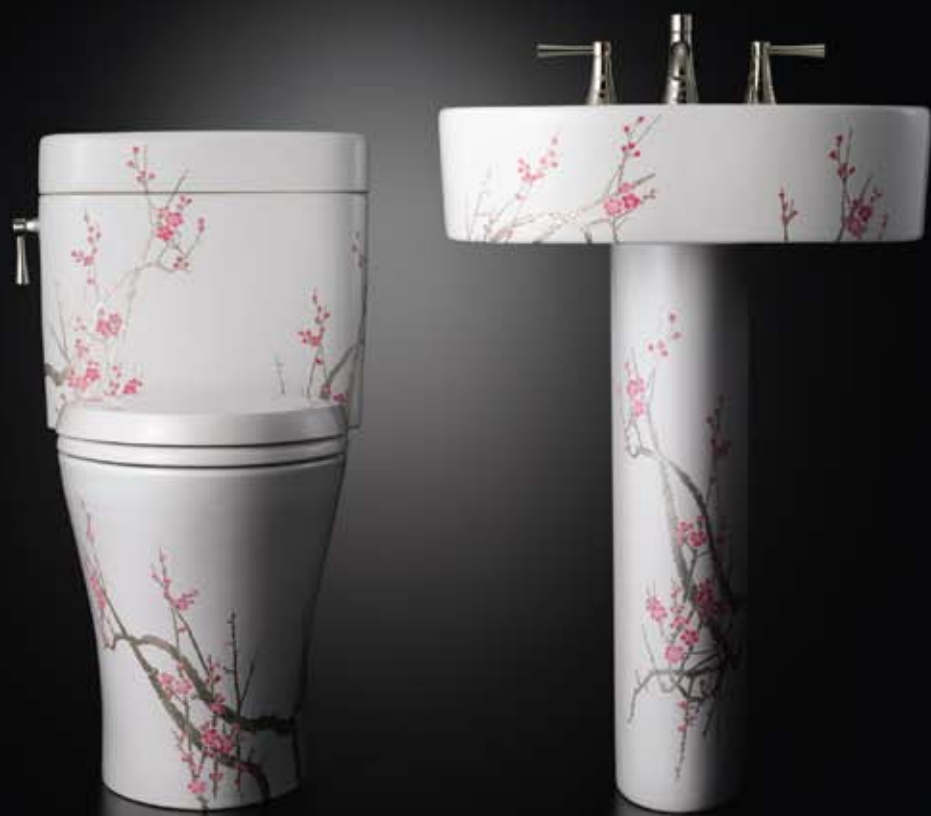
CST794EF#01-PL Toilet (Trip lever finish: Polished Nickel) 32"H x 17-7/8"W x 28"D LPT790.8#01-PL Pedestal Lavatory - 24"L x 17-3/8"D x 34"H TL794DD#PN-K1 Faucet - Polished Nickel

The Plum Tree design represents spring in the Waza Miyabi collection. With silver branches and vivid flowers, the artwork exudes life and luxury creating a year around springtime in your home. Traditionally the plum tree blooms of early spring are often used in manuscripts of Japanese poems or sonnets.