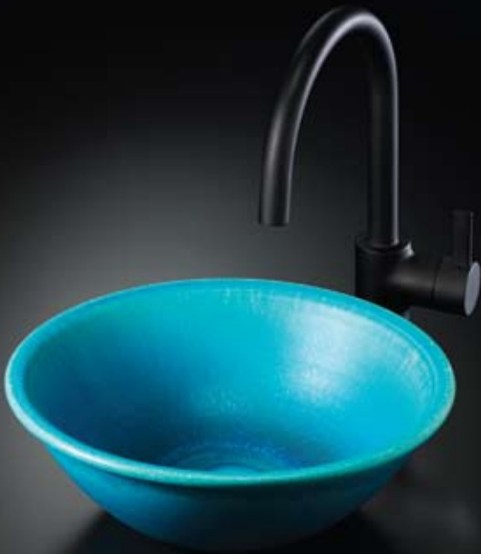
LT161#71 - Pacific Blue™ (Recommended faucet: TL382SDL#TB) 5-1/2"H x 15-3/4"DIA.

Like pristine waters washing over the shore, Pacific Blue transforms Waza Aya lavatories into an oasis that is as inspiring as any naturally occurring aqua blues.