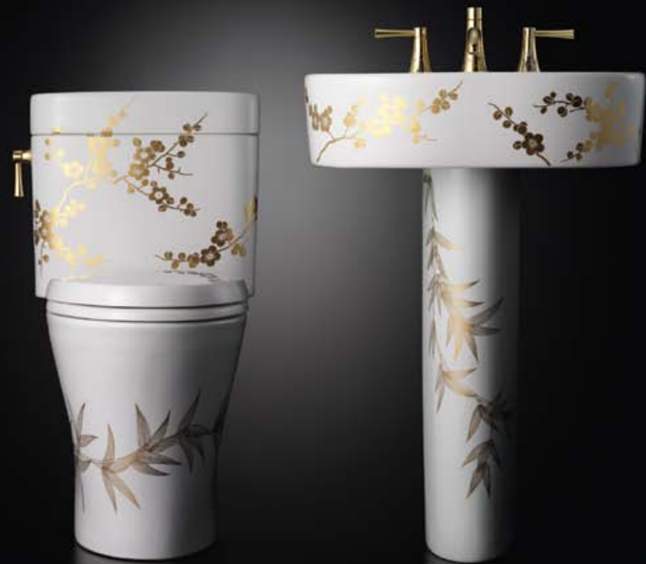
CST794EF#01-SH Toilet (Trip lever finish: Polished Brass) 32"H x 17-7/8"W x 28"D

As summer approaches, even the shadows of leaves and blossoms seem to take on a golden hue from the sunshine. Inspired by shadows that populate the natural world of summer, the golden tint of the Plum and Bamboo design also adds elements of elegance and reflect the rich, luxurious hues than only sunshine brings.