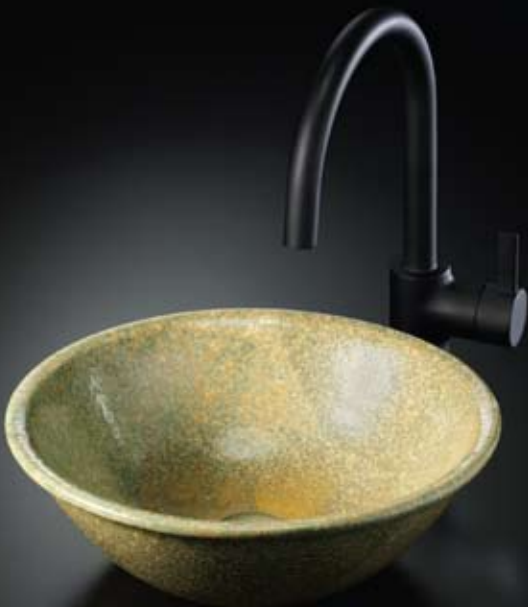
LT161#73 - Dappled Sunlight™ (Recommended faucet: TL382SDL#TB) 5-1/2"H x 15-3/4"DIA.

Waza Aya's Dappled Sunlight combines the color of clay and the green of Japanese foliage, resulting in a sensual, muted hue that is as striking as nature itself.